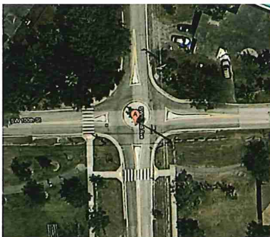
SW 100 th Street & SW 82 nd Avenue

There is no sidewalk along SW 102 nd Street, the southern perimeter on the east side of the park. The installation of a sidewalk would provide a pedestrian route to access the existing pedestrian entrance points along the south side of the park.