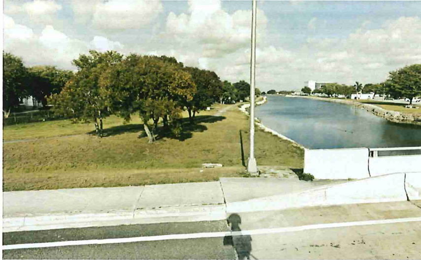
Black Creek Trail