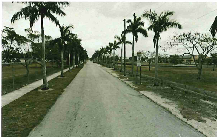
SW 115 th Avenue

It is recommended that a bike lane, signage and street trees be added to SW 216 th Street to provide connectivity to both greenway trails.