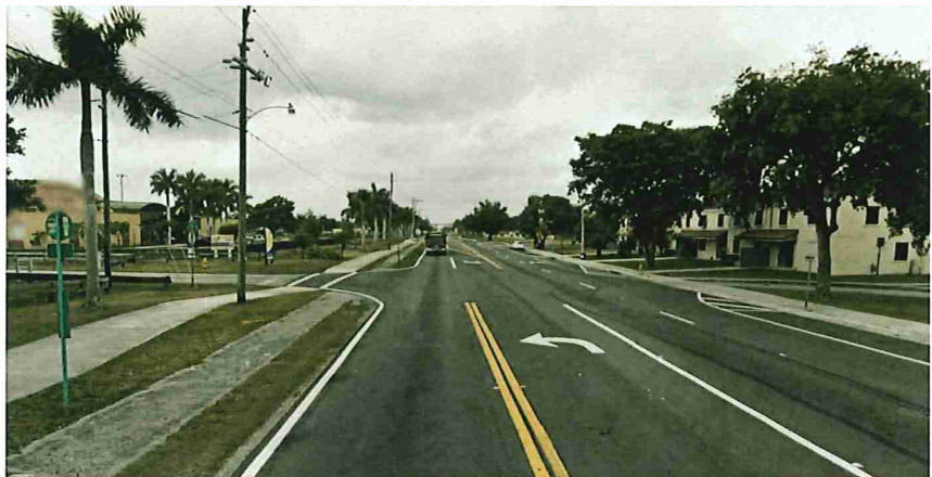
SW 216 th Street and SW 114 th Avenue

The northern boundary of the park, bordered by SW 216 th Street, has an existing sidewalk. It is recommended that street trees be added to the right of way on the south side of the street to shade pedestrians. A crosswalk is recommended at SW 216 th Street and SW 114 th Avenue to facilitate pedestrians crossing from the multifamily residential development and other residences north of the park.